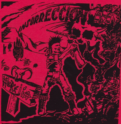
Herejia - Insurreccion (1990)