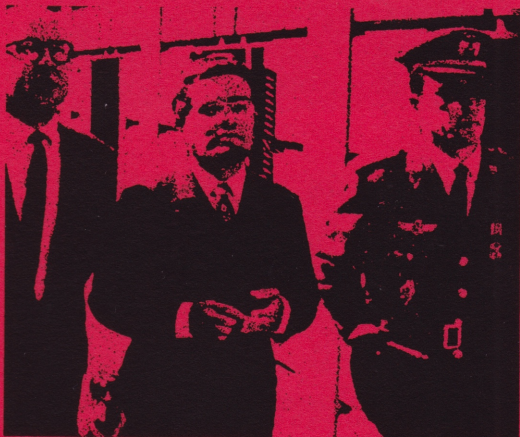
Arrabal on the day of his proceeding for crimes against the state

"I'm an anarchist and an anarchist of anarchism. I'm a member of an anarchist party where I am its sole official, spokesperson, and militant; and I am always close to kicking myself out."